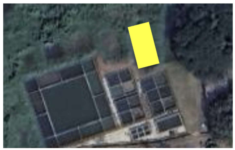
location: College of Fisheries, mangaluru

2 x USB 3.2 Gen 2, 2 x USB 2.0), Power Supply: 500W or higher. The location, depicted in the image below, measures 13ft X 48 ft and should include essential stone pitching and access for conducting experiments.